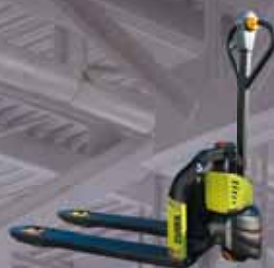
Lithium-ion hand pallet truck 1.200 kg