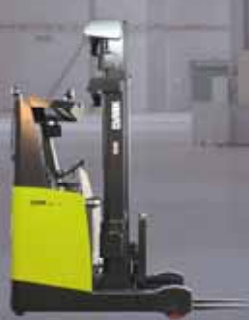
Reach truck 1.400 / 1.600 kg