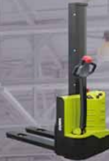
Pallet stacker 1.000 kg