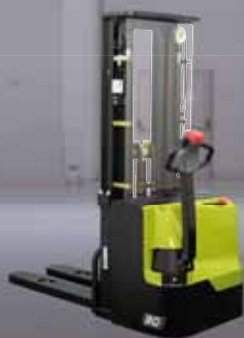
Pallet stacker 1.200 / 1.400 kg