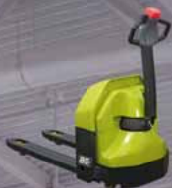
Low lift pallet truck 1.800 kg