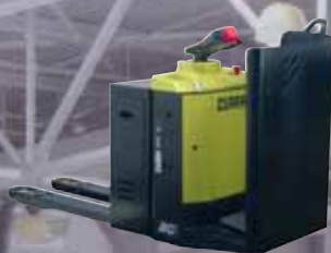
Low lift pallet truck Platform version 2.000 kg