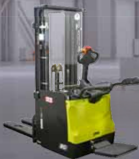
Pallet stacker Platform version 1.600 kg