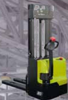
Pallet stacker Multi-purpose vehicle 2.000 kg