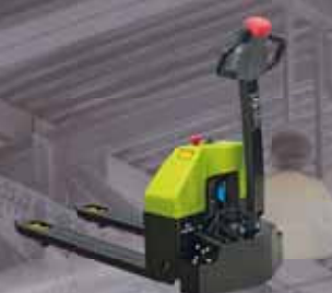
Low lift pallet truck 1.500 kg