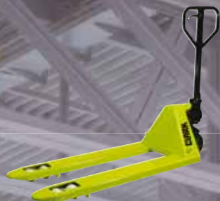
Hand pallet truck 2.500 kg