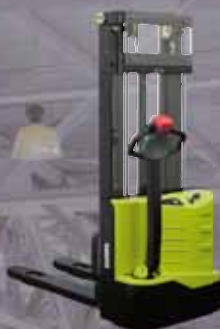
Pallet stacker 1.000 kg