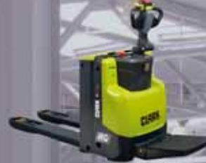
Low lift pallet truck Platform version 2.000 kg