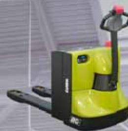
Low lift pallet truck 2.000 kg