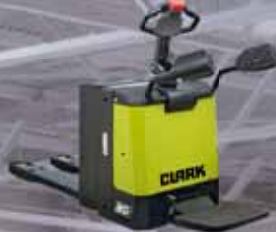
Low lift pallet truck 2.000 kg