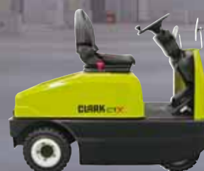
Elektric tow tractor 4.000 / 7.000 kg