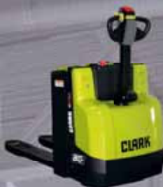
Low lift pallet truck 2.000 kg