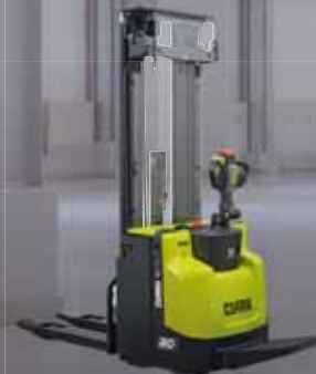
Pallet stacker Platform version 1.200 / 1.600 kg