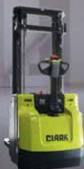
Pallet stacker 1.200 / 1.600 kg